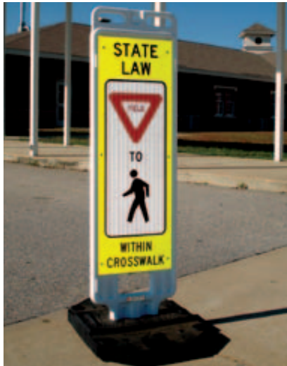
SKU# R1-6-WB Shown Above

SKU #'s: R1-6-WB, R1-6a-WB, R1-6b-WB, and R1-6c-WB